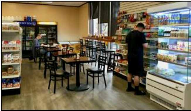
Updated Horizon House Deli